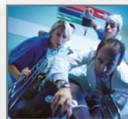
CoBRA SOFTWARE ADD-ON: MEDICAL