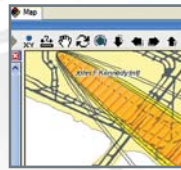
CoBRA SOFTWARE ADD-ON: GIS

GLOBAL INFORMATION SYSTEM AND PLUME PLOTTING