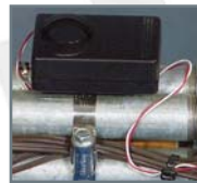
CoBRA SOFTWARE ADD-ON: IED

IMPROVISED EXPLOSIVE DEVICE RENDER SAFE TOOLS