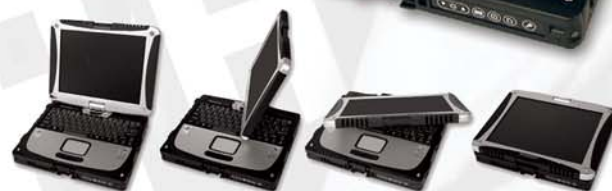
CoBRA TABLET CRITICAL DECISION SUPPORT FIELD SYSTEM